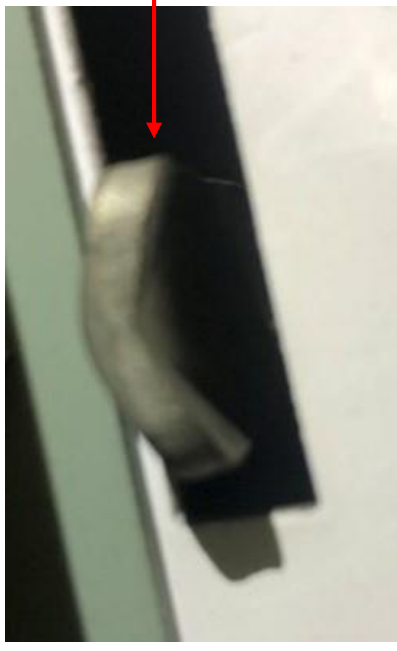
Showing the slot in the metal work between the cell and the cable tier with the door latch tongue in place when door is closed