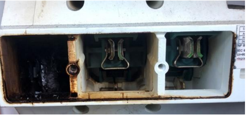
The red phase contact after the plastic cover was removed. The other two phase contacts are still in working order.

Note all the main cable connections to the isolator are secure, tight and show no signs of a hot joint