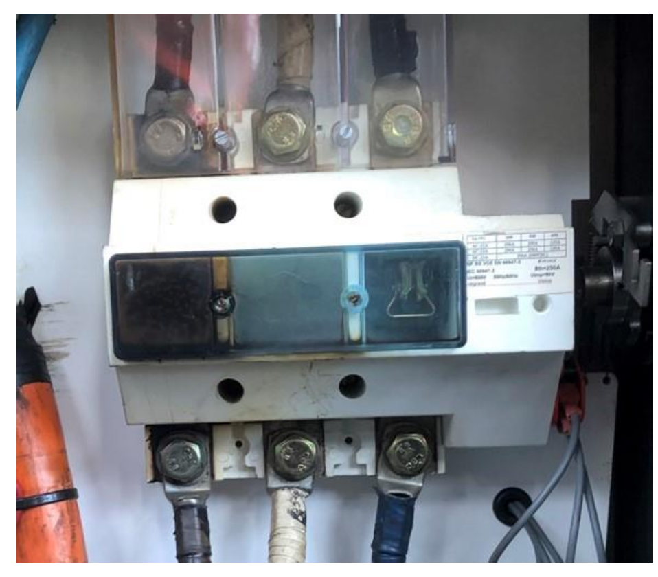
The field isolator contact cover as found.

A pump which had been in regular service was fully isolated for periodic maintenance. An electrician doing the maintenance has notice the full load isolator in the field had a blacken window over the contacts. A closer inspection has found the red phase contact inside the isolator to be welded closed and had not opened when the isolator handle was placed in the open position. When measured across the damaged contact less than one ohm was recorded. All connections to the isolated we found to be secured and in a good working state.